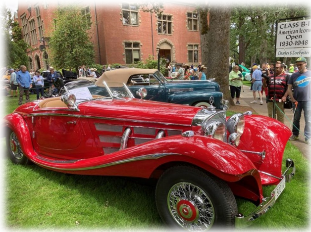
2022 Best in Show – 1935 Mercedes 500K